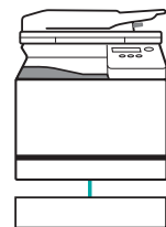
MX-CS11 500-sheet Paper Drawer