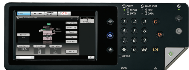
Easy to use LCD control panel ensures easy navigation

For smaller workgroups, the 26 pages per minute (ppm) MX-M266NV has plenty of power to handle your daily printing and copying requirements. Larger teams will appreciate the extra speed of the 35 ppm MX-M356NV and 31 ppm MX-M316NV. And everyone will love the crisp detail and fine line perfection that comes from the 1200 x 600 dpi resolution with 256-level greyscale.